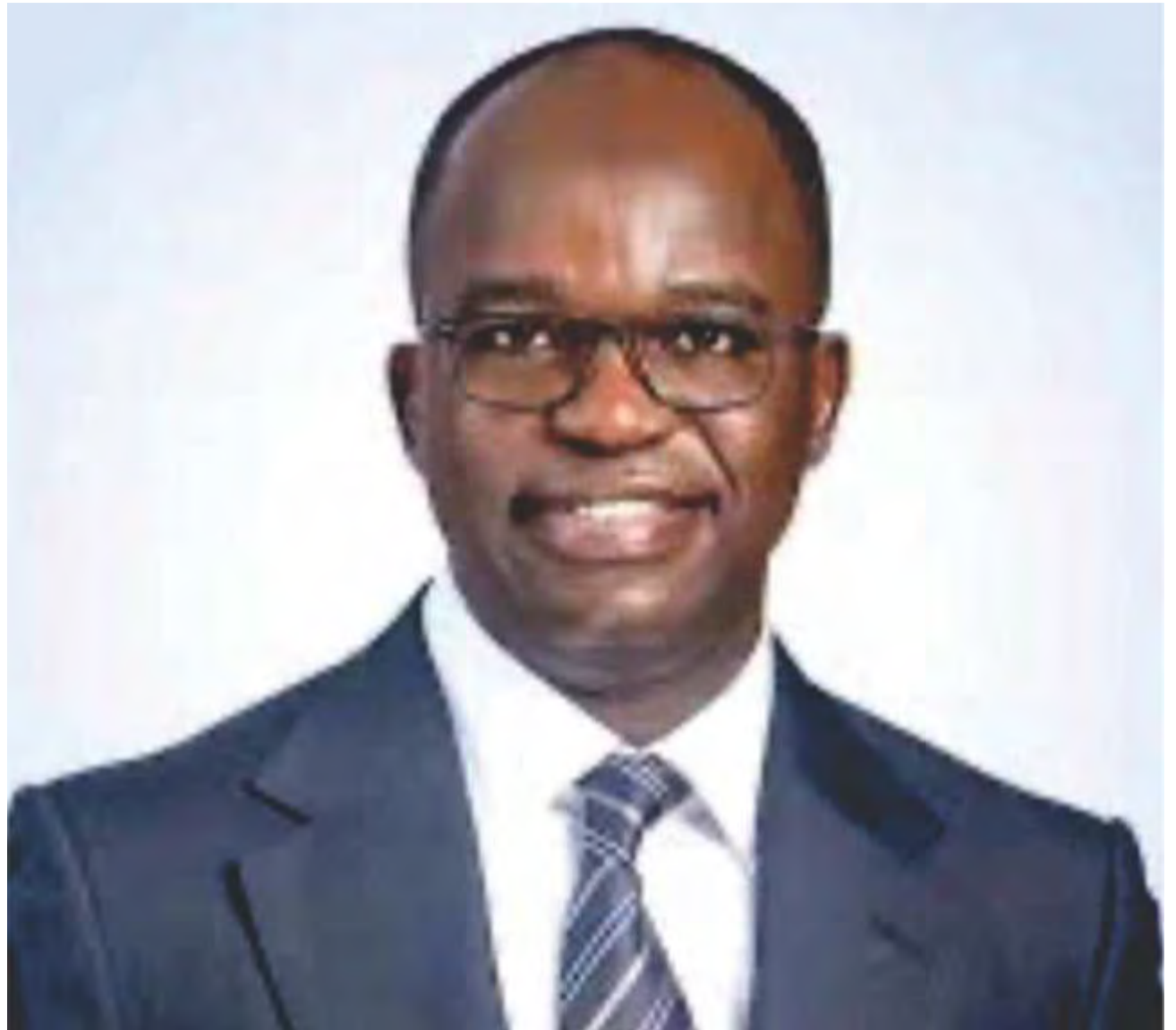
Senator Adetokunbo Abiru

I would also like to use this opportunity to urge the Senators-elect of the 10th National Assembly to be determined to be more effective in carrying out the constitutional responsibilities of oversight for the purposes of ensuring that public policies are implemented in accordance with the legislative intent of good governance and public accountability. This will curb the persistent cases of poor administration, under performance, corruption, fiscal indiscipline, lack of accountability and arbitrariness in government MDAs (ministries,