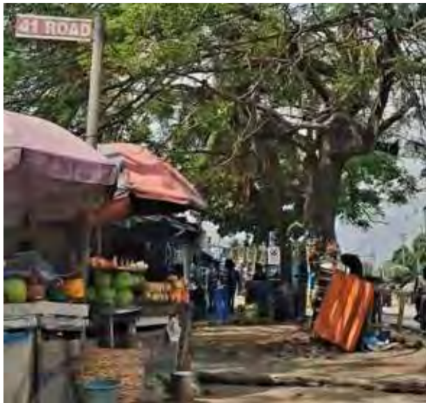
Roadside stalls in Amuwo-Odofin

The authorities of Amuwo-Odofin LG, the Federal Housing Authority, Amuwo-Odofin Local Government, and the Lagos State Government have given a 72-hour notice to the roadside trader in Amuwo-Odofin axis to vacate the spaces. The authorities said they have decided to restore sanity in the community by cracking