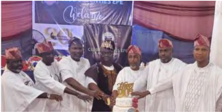
Club 70's Epe members cut cake in celebration of its 20th anniversary

C lub 70s of Epe has last week celebrated its 20th anniversary.