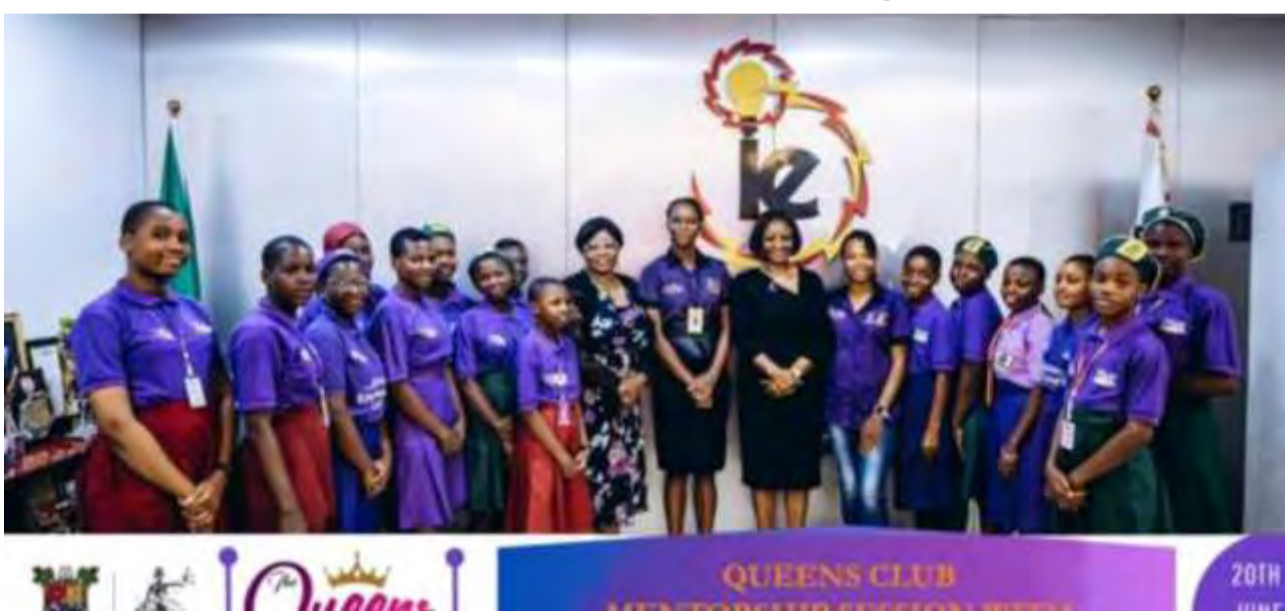
Queens Club members at Ikeja Electric

The event which is an initiative established by the