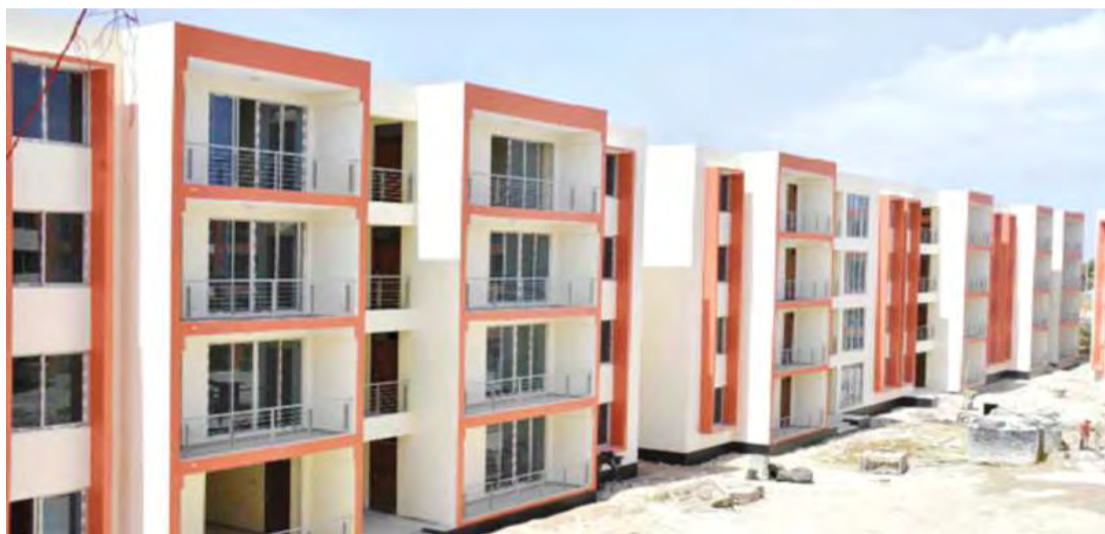
Lagos housing scheme

Lagos State Government will in no way be liable for any loss incurred through the patronage of such fraudsters or impostors. He, however, warned that any individual or organisation caught impersonating the State Government would be prosecuted.