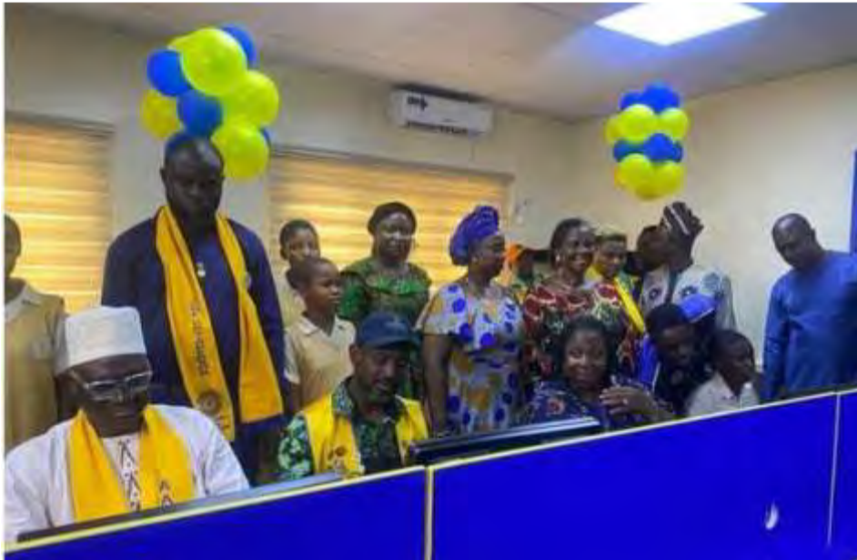
The Lions Club members experiencing the ICT center built by them

The Lion's Club International has donated an Information and Communication Technology (ICT) centre to a public school in Somolu LGA.