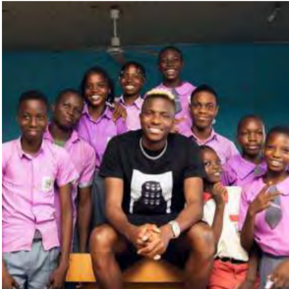
Victor Osimhen and some students of the school

N igerian professional footballer and Seria A Napoli club striker, Victor Osimhen, has revealed the reason why he visited his primary school in the Oregun area of Ikeja, Lagos. According to him, he cannot forget his primary school which is the foundation for whatever he has become. He revealed this in a post on his Instagram page. Osimhen who lived in Olusosun, a small neighborhood near Oregun attended Olusosun Primary