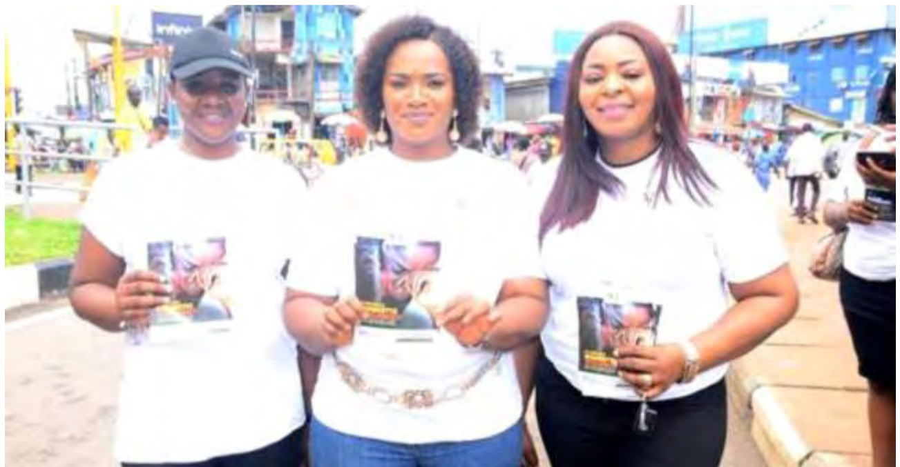
DSVVA, NBA at a rally to sensitise Lagos residents

Residents of Ogba and Ikeja where the campaign was held lauded the efforts of