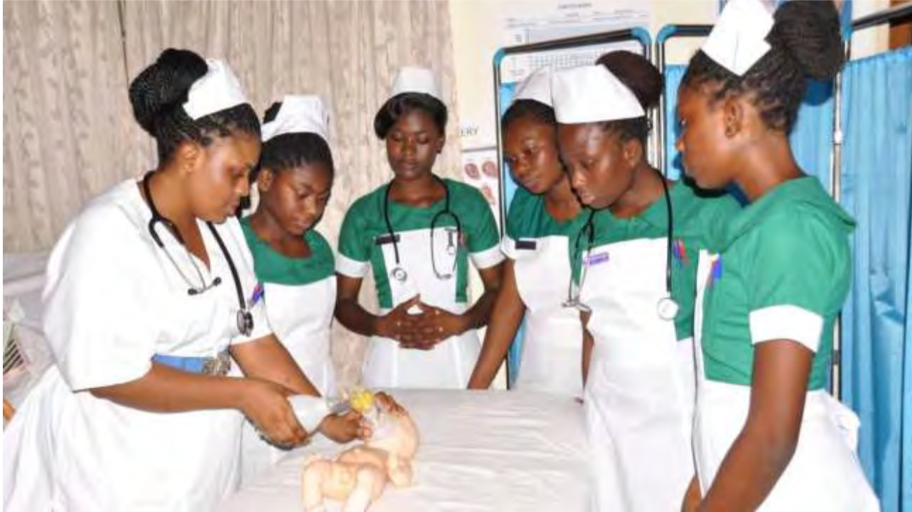
Student nurses at the hospital