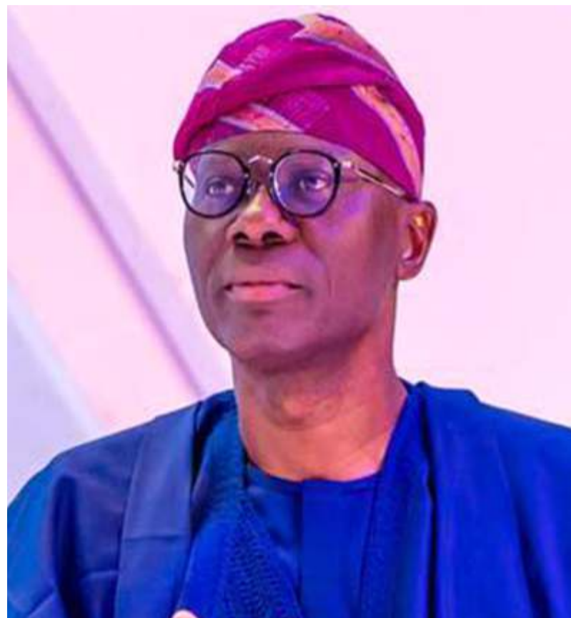
Mr. Babajide Sanwo-Olu