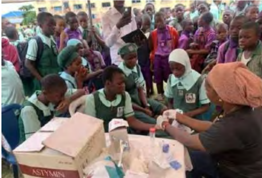
Community high School students on sickle cell sensitization programme