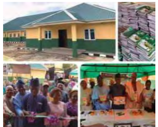
Owolabi primary School commissioning

"The craving for a government-owned primary school had been an age-long wish of the people. This is due to the non-