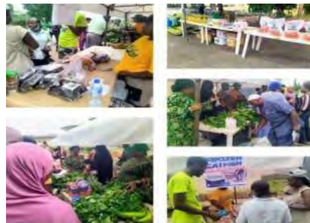
Ikorodu Farm Fair Activities

The farm fair, spearheaded by Ikorodu Local Government, was in partnership with the United Apex Farmers in Ikorodu.