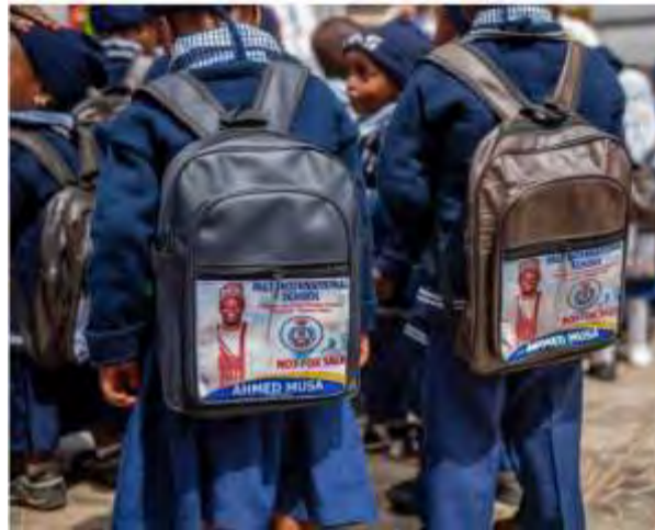
Ahem Musa Learning Kits

"It's incredible how education can shape young minds and