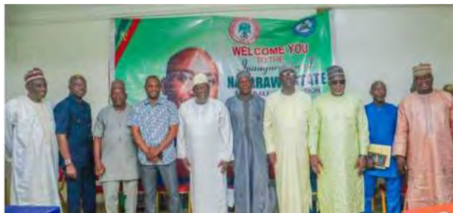
NFF Normalization Committee