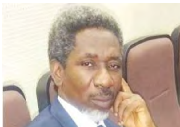
Hon. Barr. Okey-Joe

The lawmaker representing Oshodi-Isolo Constituency II in the House of Representatives, Hon. Barr. Okey-Joe has revealed his plans for his constituency with Lagos State Governor, Babajide Sanwo-Olu.